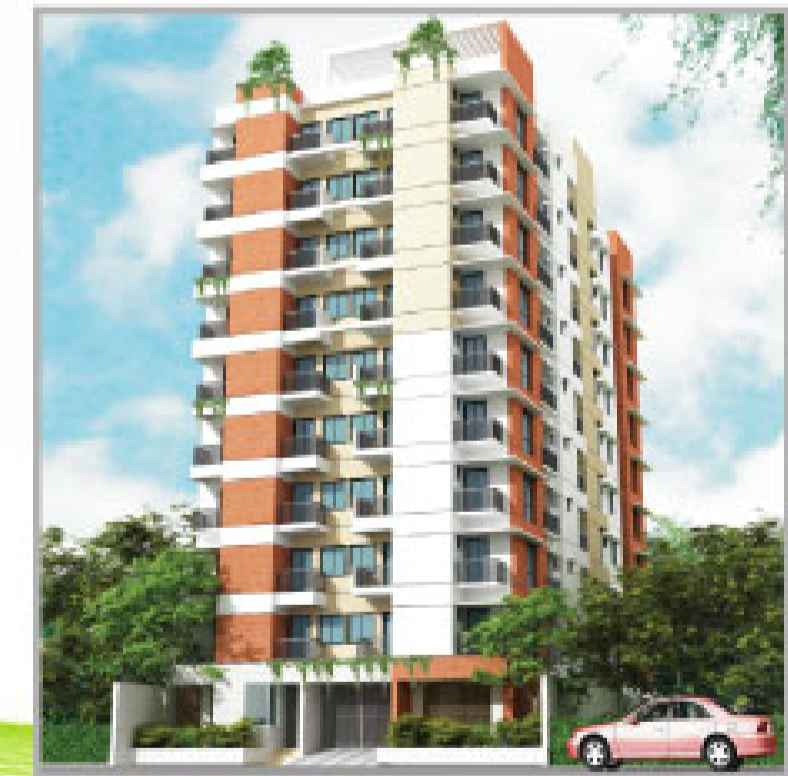
Vista Kamal Tower @ Middle Ajampur, Sector 4, Uttara