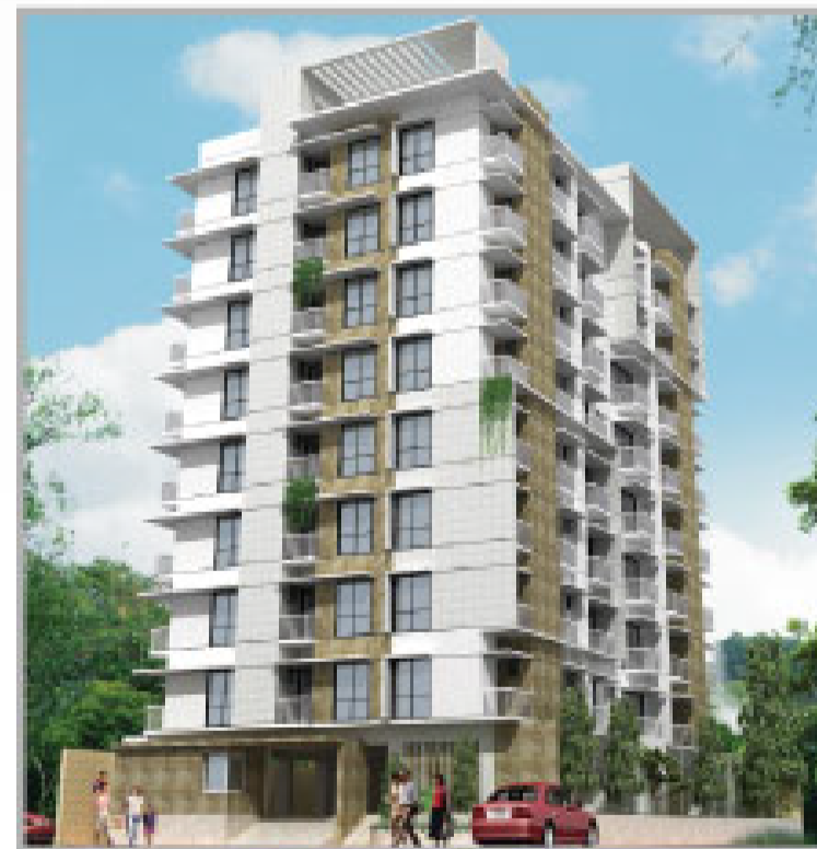
Vista Mj Tower @ West Mollartek, Sector 4, Uttara