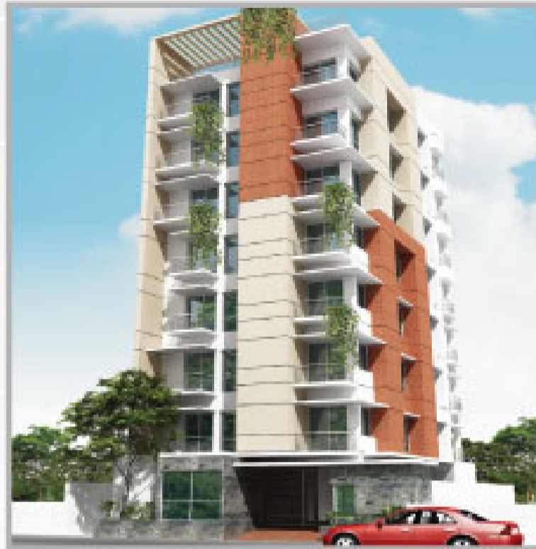
Vista Ashiana Garden @ Mirpur-2, Dhaka