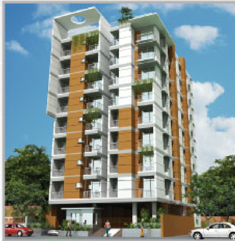
Vista Kabir Tower @ Mirpur-10, Dhaka